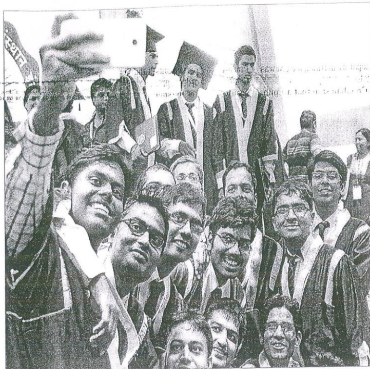
■ IIT-Indore students take selfies after they are conferred degrees at the 3rd convocation of the institute at their Simrol campus, on Monday.

MASHELKAR ALSO SPOKE WORDS OF INSPIRATION AND WISDOM TO THE OUTGOING BATCH