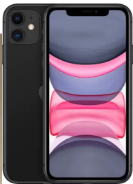
Apple iPhone 11 & 11 Pro - New launch