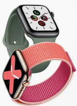
Apple Watch Series 5 - New Launch