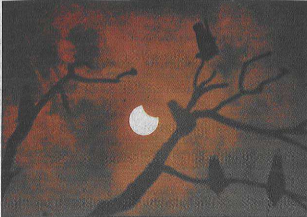
The solar eclipse was visible in Indore, but the 'ring of fire' was not seen in sky of the city. (R) Children view the solar eclipse on Sunday