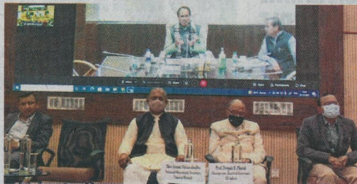
Chief Minister Shivraj Singh Chouhan addresses inaugural function of MPVS-2021 in virtual mode on Wednesday

The CM also stressed the need for developing a scientific temperament among students. "Instead of schools in every village, we'll open schools at every