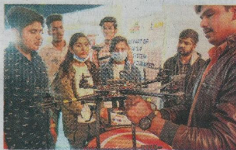
An expert briefs students on drone technology during the Expo at the SGSITS

The CM said that an unscientific lifestyle leads to many diseases. "Covid-19 is one such disease. Fear of Covid-19's third wave looms over the state. We'll deal with it in a scientific way," he concluded.