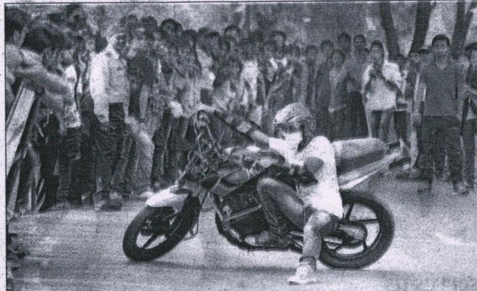
Students displaying their biking skills during the Gravity Control event, organized as a part of IIT-Indore's Fluxus '13

The event Ransense organized by Literary Club of institute tested the participants' ability to find sense out