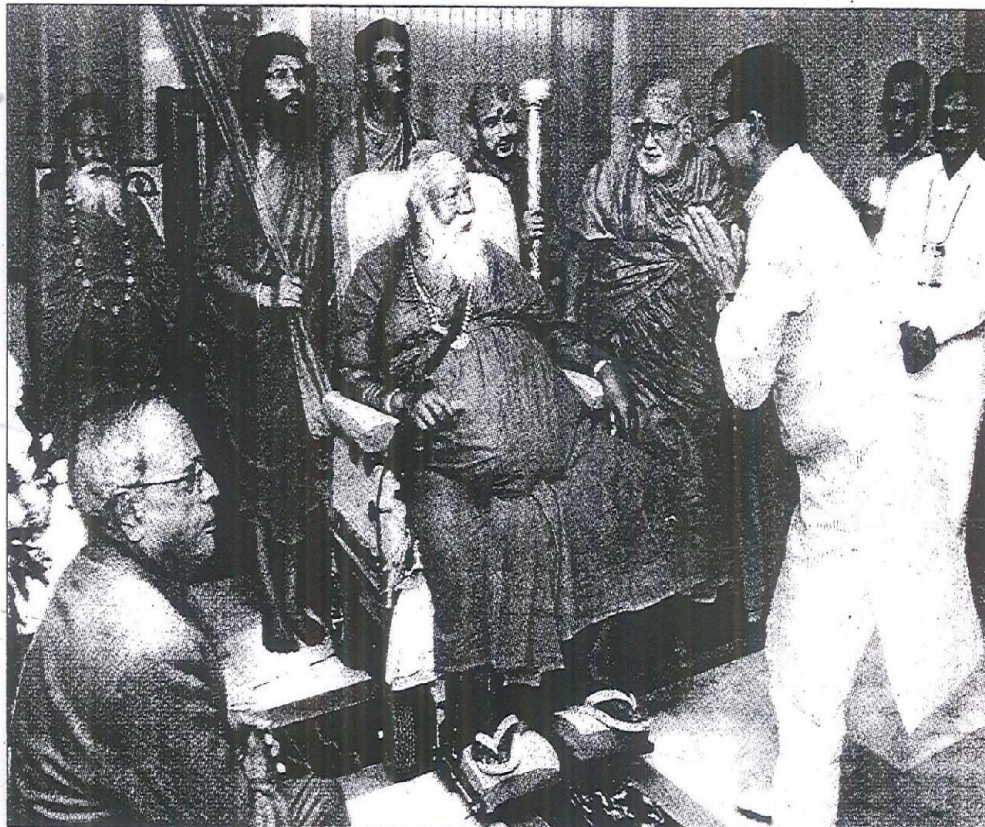
Chief minister Shivraj Singh Chouhan seeks blessings of Jagadguru Shankaracharya Swami Swaroopanand Maharaj during inauguration of the Shankaracharya Netralaya at Jhoteswar, Narsinghpur on Friday.