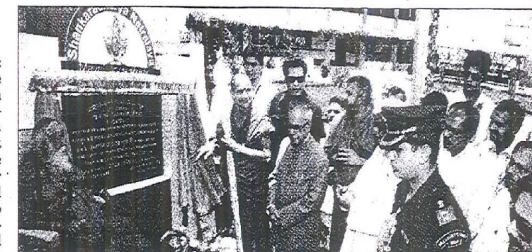
President inaugurating Shankaracharya Netralaya at Jhoteswar, Narsinghpur on Friday.

Mukherjee said there is reference of eye diseases and tools used for treatment in ancient Sanskrit text Shushruta Samhita. He said the National Programme for Control of Blindness was launched in 1976, to reduce the incidents of blindness, build up eye care facilities across the country and develop human resources for this sector. This has been successful in terms of conducting cataract operations, eye screening of schoolchildren and collection of donated eyes, Mukherjee said adding much more need to be