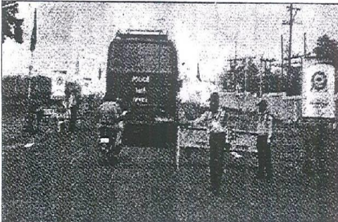
Heavy police force and security deployed at IIT Indore campus on Friday.

based on his academic and overall performance.