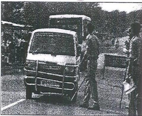
Security check at Simrol ahead of President Pranab Mukherjee's visit to the institute in Indore on Friday.