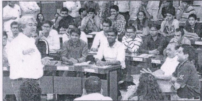
Participants during second annual i-5 summit on Saturday